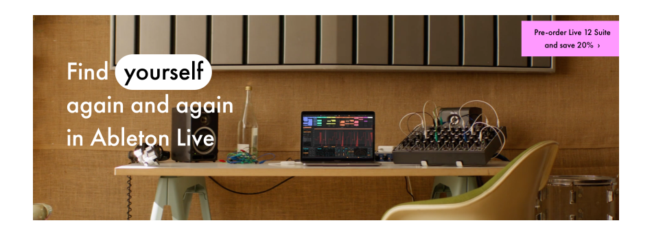
Coming soon - Ableton Live 12

With 32-bit float recording, you never have to adjust levels. The H4essential captures every nuance of your sound ensuring high-quality, clip-free audio in every take. Find out more <a href="here">here</a>