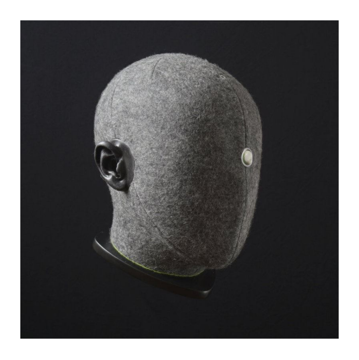
ASDP Trinaural Head is on tour in Scotland!

Do you want to take advantage of the ASDP Equipment Loan Scheme? Our Inari Trinaural head is currently based in Glasgow If you would like to loan it for a project or to have a play, contact us on <a href="mailto:admin@theasdp.com">admin@theasdp.com</a>