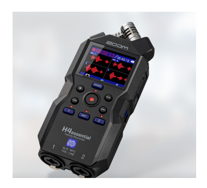
New Zoom H4essential

With 32-bit float recording, you never have to adjust levels. The H4essential captures every nuance of your sound ensuring high-quality, clip-free audio in every take. Find out more <a href="here">here</a>